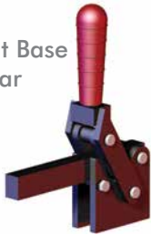
548 Straight Base Solid Bar